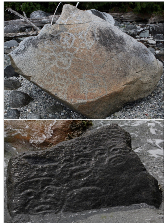
Tikyá (Topaze Harbour) Petroglyphs

8:00 Registration 9:00 Meeting Commences